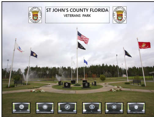
Veterans Park, St. Johns