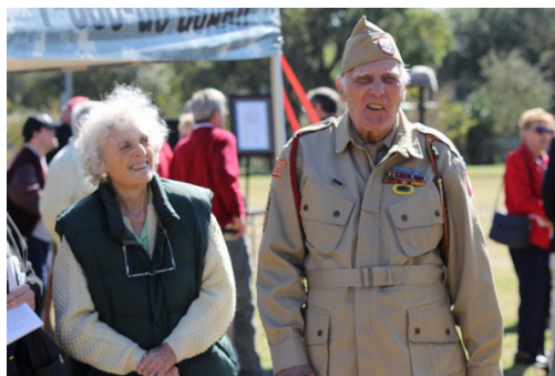
Veterans Day 2011 Honoring WW II Veterans